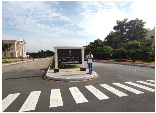
Infosys Global Campus