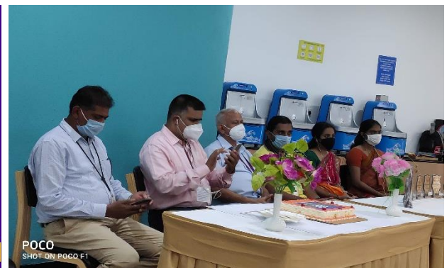
100 Days Celebration of Success