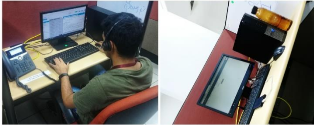
The Workplace, Infosys Mysuru