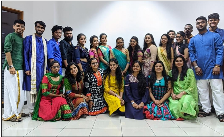
The TEAM at Infosys, Mysuru.