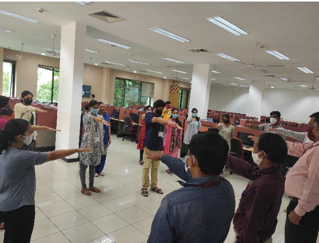
Oath taking to commit ourselves to serve the people