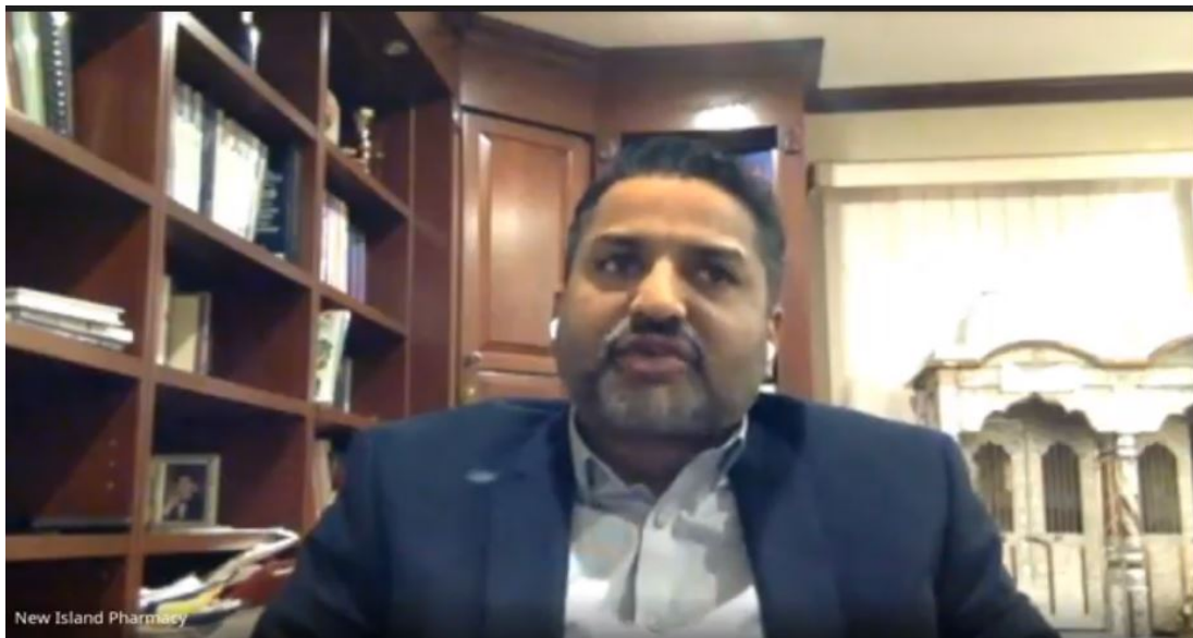
Speaker during interactive session with participants

Students of fifth & sixth year PharmD and II M. Pharm Pharmacy Practice students attended the guest lecture. As it was an interactive session, students actively participated in the discussion, and the session was conducted using online (Google meet) platform.