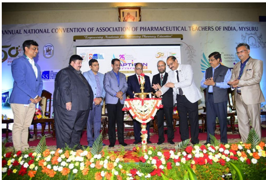
Photo 3. Lamp lighting by dignitaries on the dais