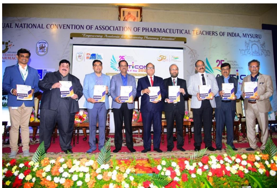
Photo 5. The souvenir was released by the dignitaries on the dais.