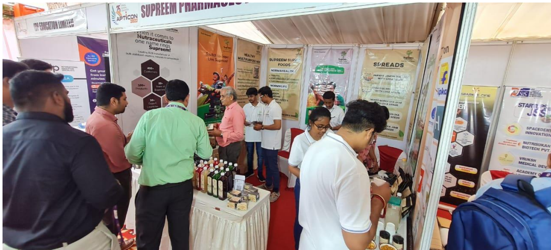
Photos of Exhibition and Stalls