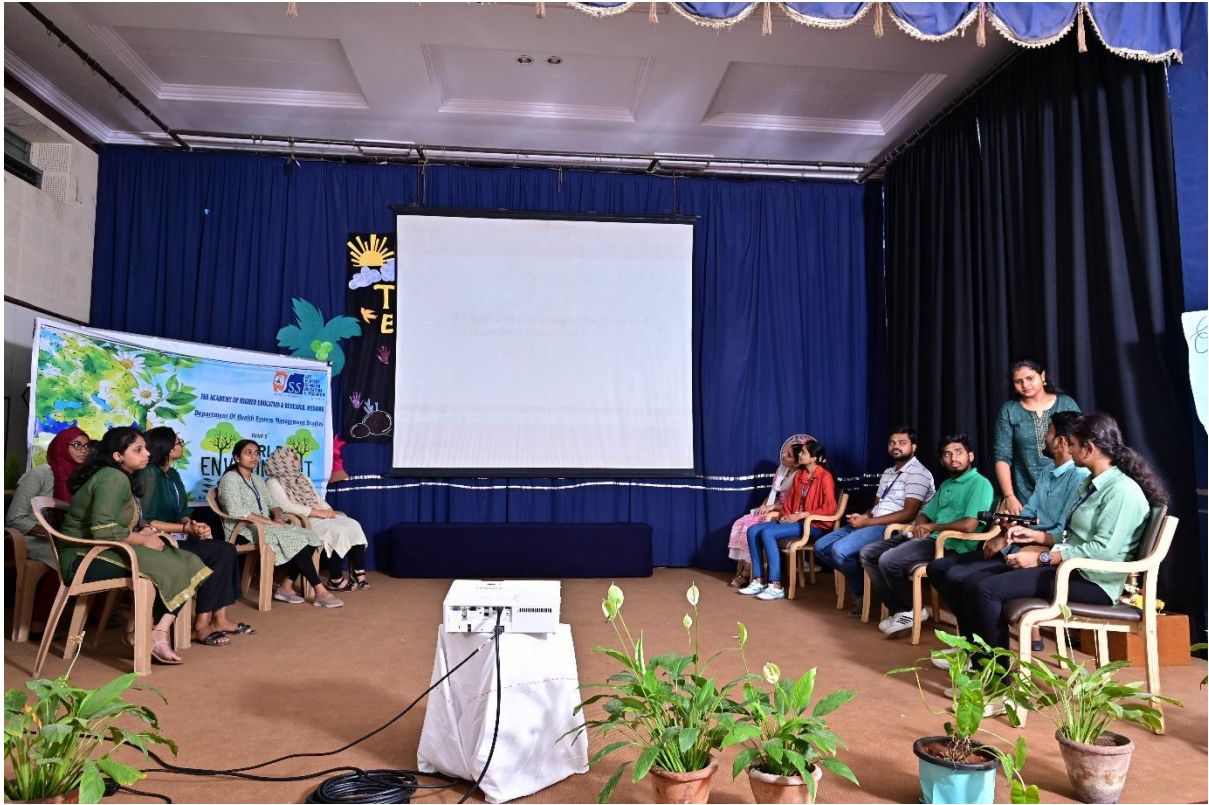
Quiz Competition on World Environment Day was Organised and Students were actively Involved and Participated