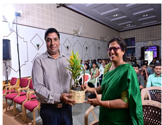
Dignitaries were presented with Green Saplings with the concept of Go Green for a Better Environment