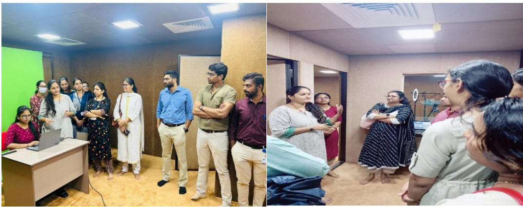
Media Centre 1 & 2, Agrahara Campus, JSS AHER