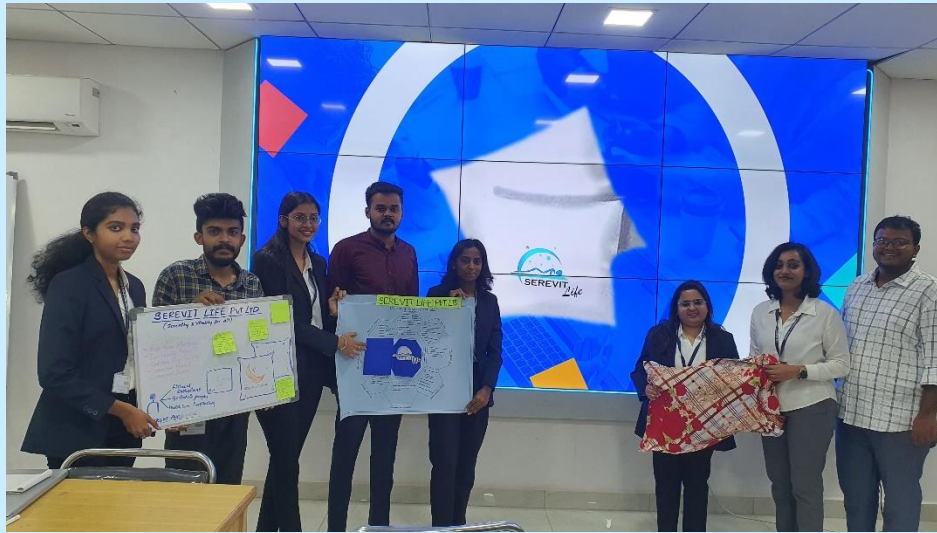
Pitching Platform for innovative Startup Ideas