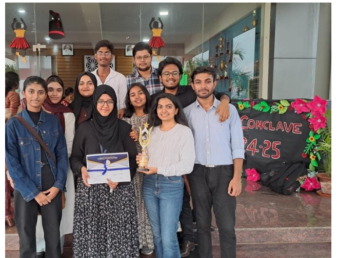
Radiant smiles adorn the faces of the participants ,as they receive their well-deserved awards, a testament to their hard work, dedication, and achievement at the intercollege fest."