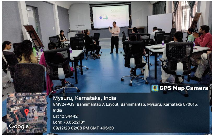
Dean (IQAC) addressing the gathering.

The Internal Quality Assurance Cell (IQAC) conducted a two-day workshop on "NAAC Preparedness and Awareness" on December 8th and 9th, 2023. The workshop was aimed at NAAC criterion coordinators of constituent colleges, team leads, and IQAC Coordinators of JSS Academy of Higher Education & Research. The first day covered topics including an introduction to NAAC accreditation, its importance, and the NIRF ranking framework, followed by detailed sessions on NAAC Criteria 1 through 4. The second day, held at the Medical Education Unit, JSS Medical College, Mysuru, focused on deep dives into Criteria 5 through 7, concluding with a Q&A session.