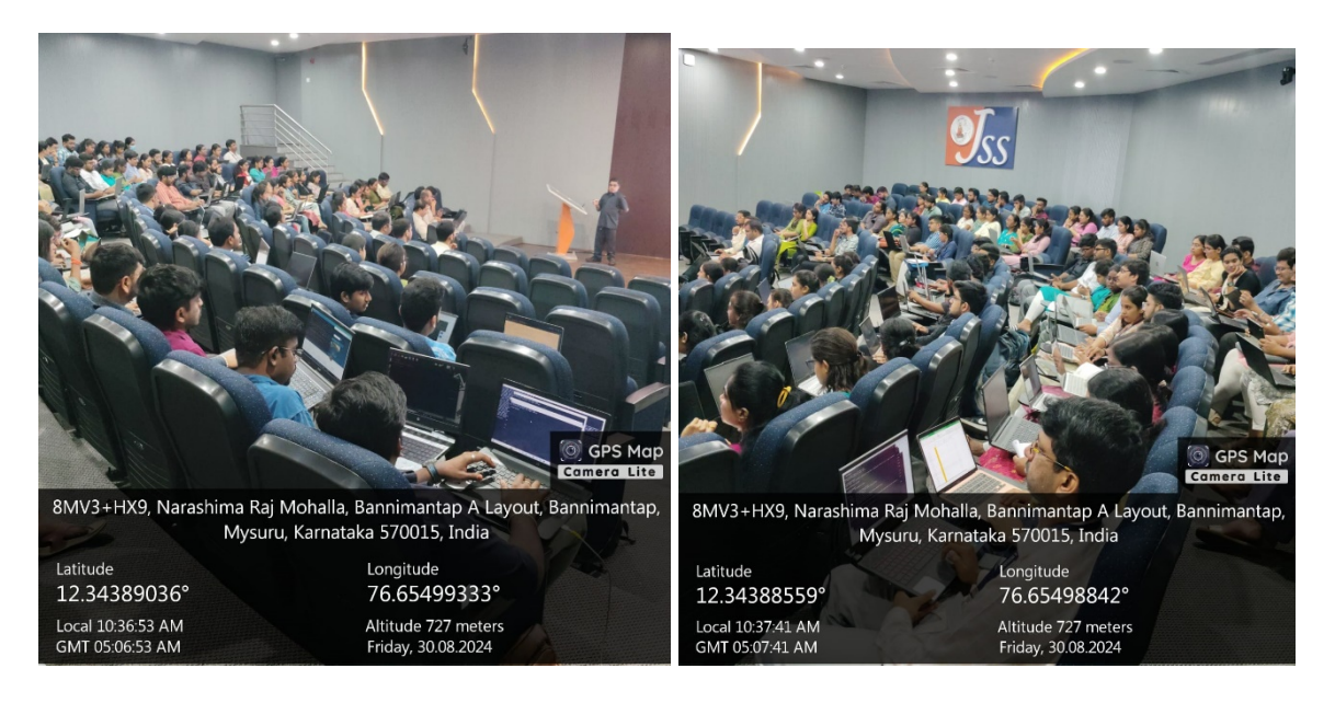
Day 2, started with a Session on Basics of Python and the speaker explained about the differences between the R language and Python and their advantages separately.

After the lunch break, the speaker along with the delegates worked on Advanced techniques for data analysis using R language, and the feedback on day 1 indicated that it was indeed a very useful session.