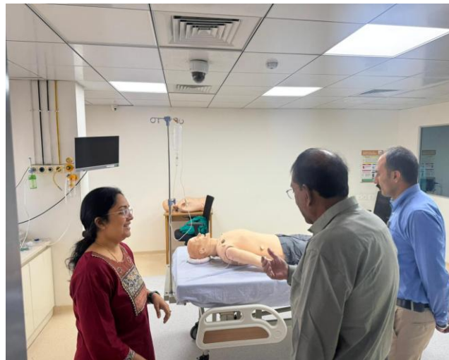
Skill and Simulation Center, JSSAHER