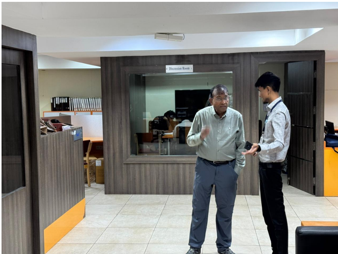
Clinical pharmacy practice Department, JSS Hospital