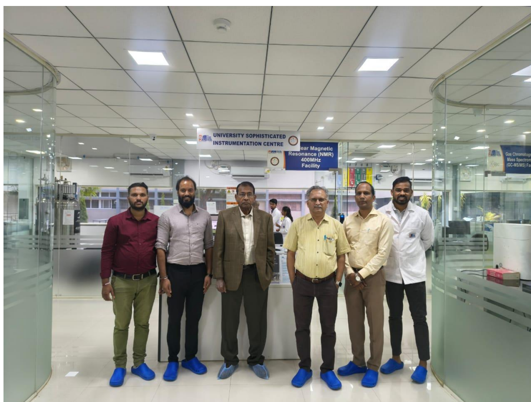
University Sophisticated Instrumentation Centre (USIC)