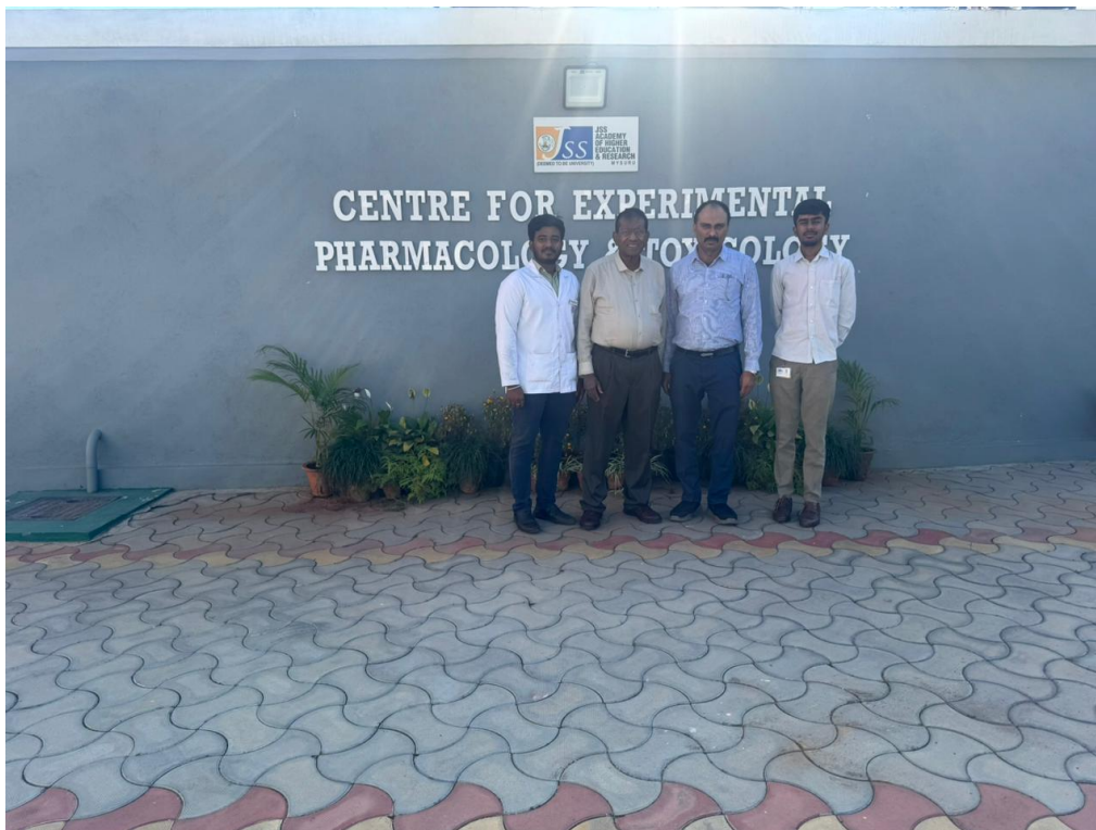
Centre for Experimental Pharmacology and Toxicology