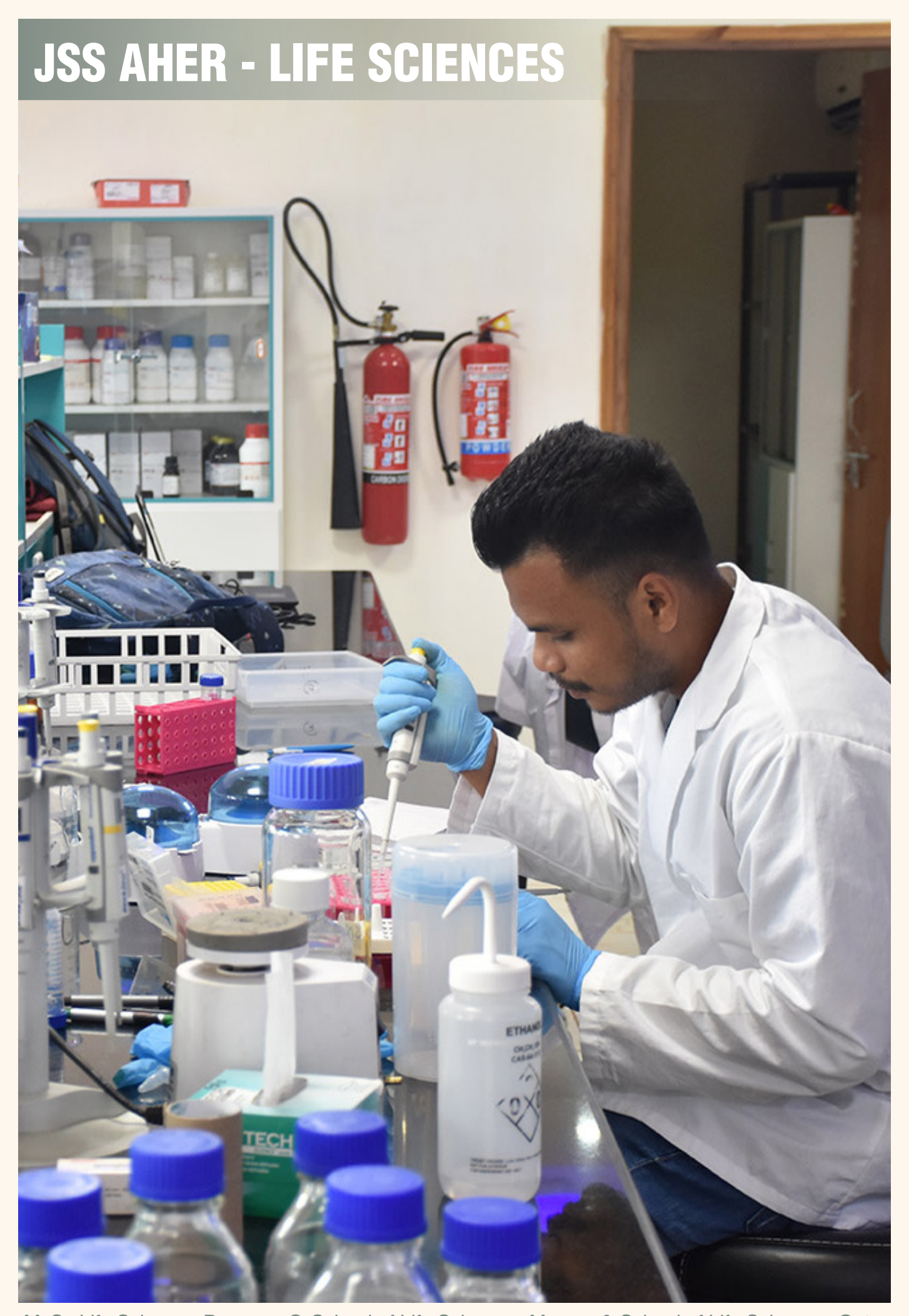
M. Sc Life Sciences Program @ School of Life Sciences, Mysuru & School of Life Sciences, Ooty