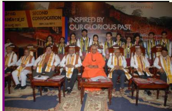
Proud moment... Gold medal winners, line-up behind the dignitaries on the dais after receiving the medals and certificates.