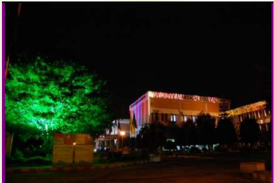
Spectacular view JSSU and JSS Medical institutions campus as seen on the eve of convocation day