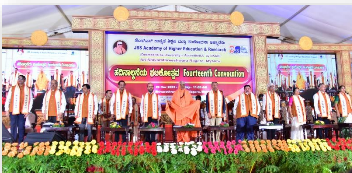
Convocation Ceremony – August gathering on and off the dais