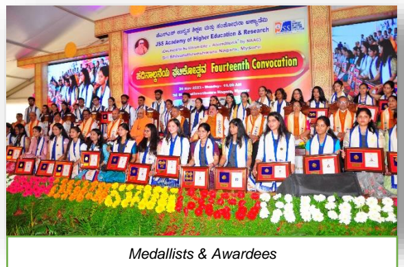
Medallists & Awardees

In all, 2546 students were conferred with their degrees/ diplomas/ fellowship at the Convocation, at Bachelors, Masters and Doctoral levels in the Faculties of Medicine, Dentistry, Pharmacy, Biomedical Sciences, Occupational Therapy, Life Sciences and Management Studies. Besides, 55 candidates shared 84 medals and awards for their academic excellence and 49 candidates were awarded PhD research degrees. The convocation ceremony was also live streamed on JSSAHER YouTube channel.